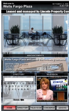
Showcase announcements, directory information and live TV

CB Richard Ellis Wells Fargo Plaza Houston, TX